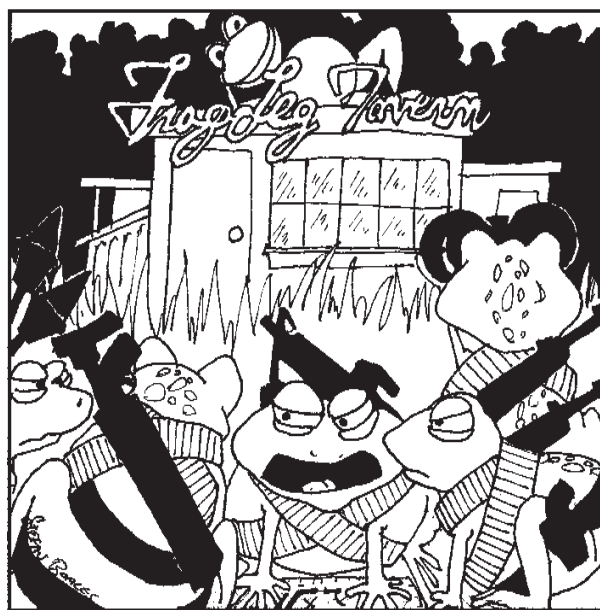
"WE GO IN TONIGHT, COMRADES!"